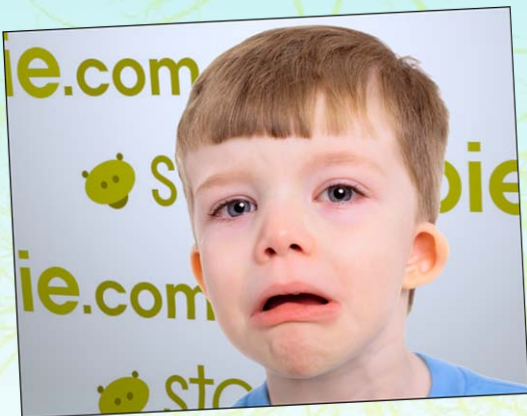
Seriously, he's feeling no pain.

So most of you already understand that Jesus says it's okay to torture. If it is okay to torture, it is certainly okay to waterboard your children for their own good. Then someday, your children will think of you when they are waterboarding their own children. That's the eternal Christian cycle of love. Those are the family values we are trying so hard to preserve. Remember: He that spareth his rod hateth his son. — Proverbs 13:24.