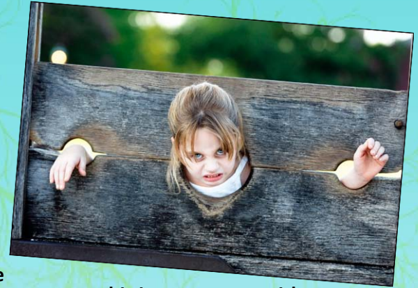
This is not torture, either.

To cap it all off, Jay Bybee was made into a federal judge on the Ninth Circuit Court of Appeals. He is one of a few judges who rule all of California. So you can be sure that the highest court governing California, just below the Supreme Court of the United States, understands that waterboarding causes no physical or emotional pain or suffering whatsoever. God bless Judge Bybee for his love of freedom and for his inspired insight into how it feels to drown.