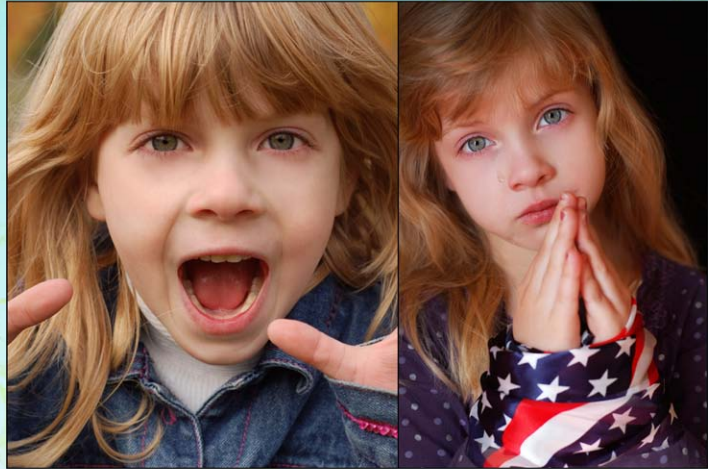
Before Waterboarding Camp this child was unrestrained! Who knows what might have become of her?